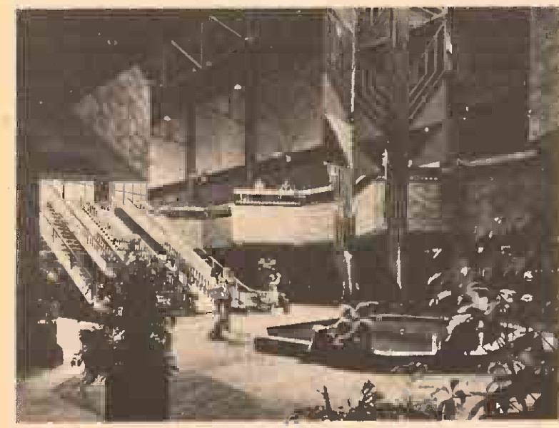
Lobby of Hyatt Regency Hotel in Los Angeles

U. S. DEPARTMENT OF LABOR OFFICE OF THE SECRETARY WASHINGTON