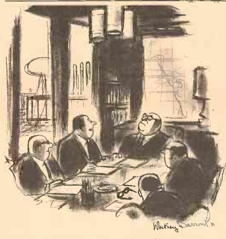
"They demand a guaranteed annual wage, four weeks' paid vacation, and an early-retirement program, and I do not think, sir, that they will accept 'Off with their heads' as a responsive answer to these demands."

Local 153 has also gained representation of the office employees of F. M. Charlton Company, New York's largest bindery. A first contract provides wage increases totaling $20 over three years.