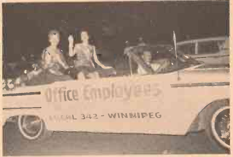
Members of OEIU Local 343 took an active role in the annual Winnipeg, Manitoba, Labor Day Parade in September.