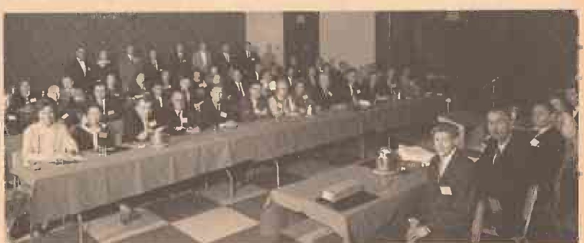
The North Central Educational Conference was held in Milwaukee, Wis., on September 22 and 23