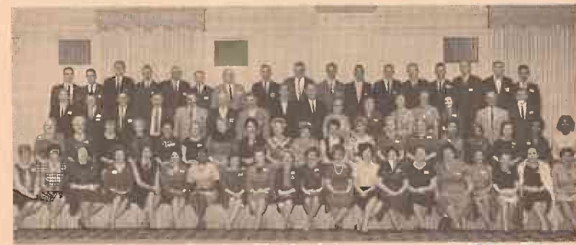
The Erie Educational Conference was held in Cleveland, Ohio, on the 5th and 6th of last month.