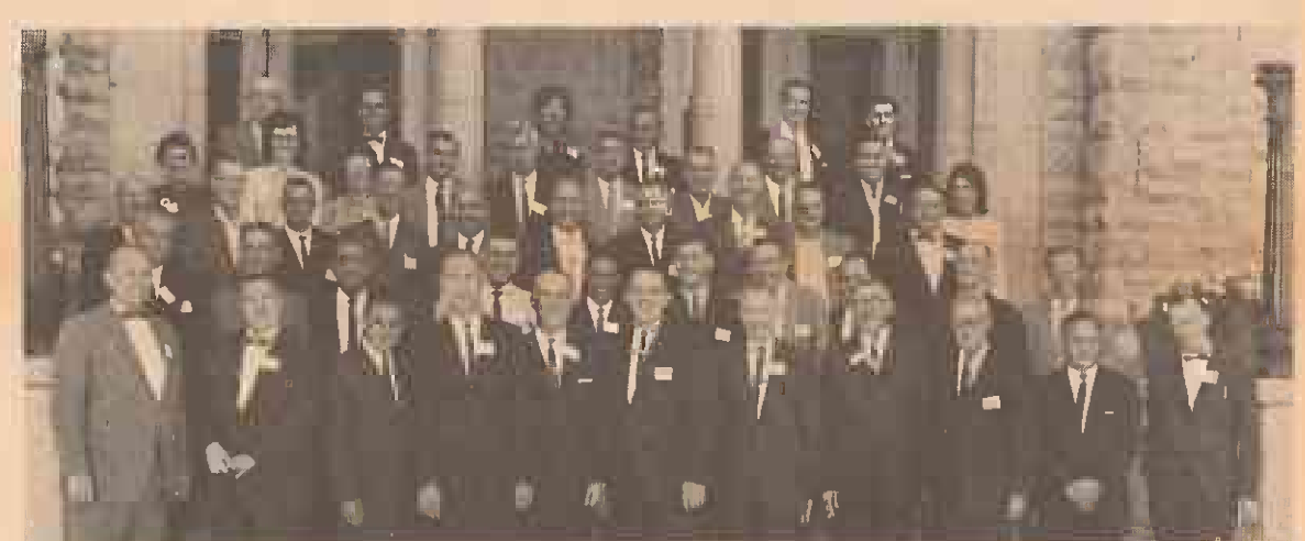
The Northeastern Educational Conference was held in Massena, N. Y., on September 14 and 15.