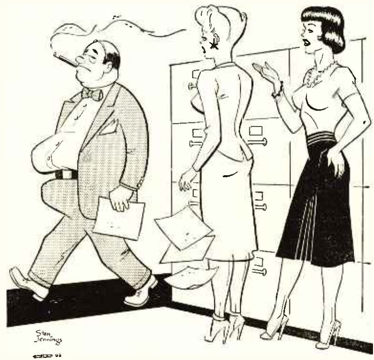
"The Boss says a raise is impossiblethat we've all got to tighten our belts."