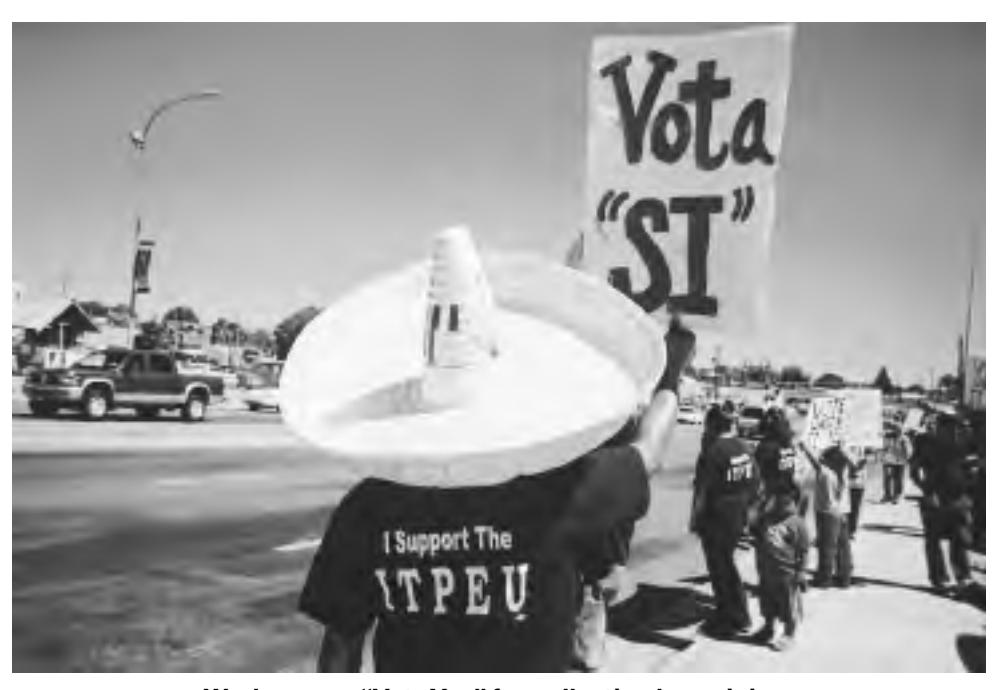
Workers say "Vote Yes" for collective bargaining.