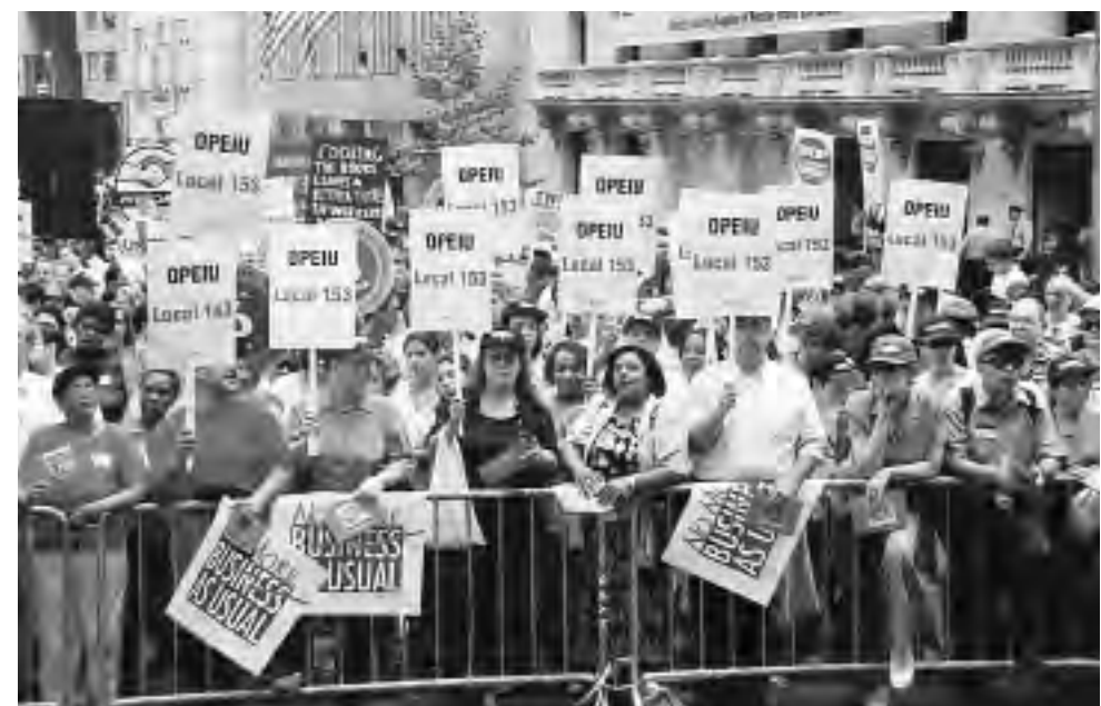
OPEIU members gather on Wall Street to demand an end to corporate greed.

"When corporate criminals invade our workplaces and our markets to steal our jobs and our savings, we must react every bit as decisively as when thieves enter our homes