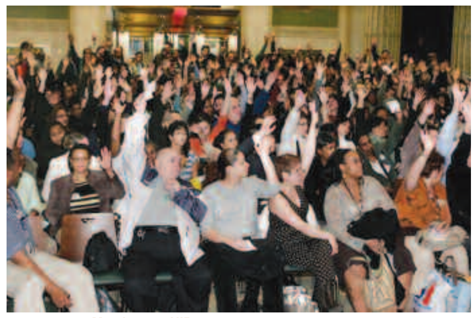
Members at HIP vote to approve new contract.

The contract expires on November 30, 2009.