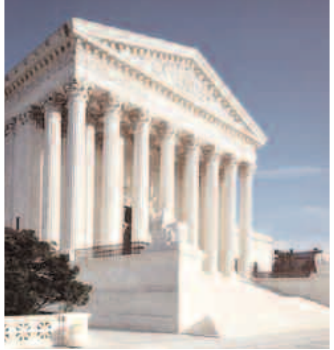
OPEIU and Local 108 sue in Federal District Court in Lafayette, Louisiana and make a motion for a preliminary injuction against PHI (pictured above is the U.S. Supreme Court).

• OPEIU, Local 108, and returning pilots will not condone, nor participate in, the harassment, intimidation, or threats of any pilot; nor will they otherwise discriminate against any pilot who continued working during the union-called job action, and that any pilot participating in such activities will