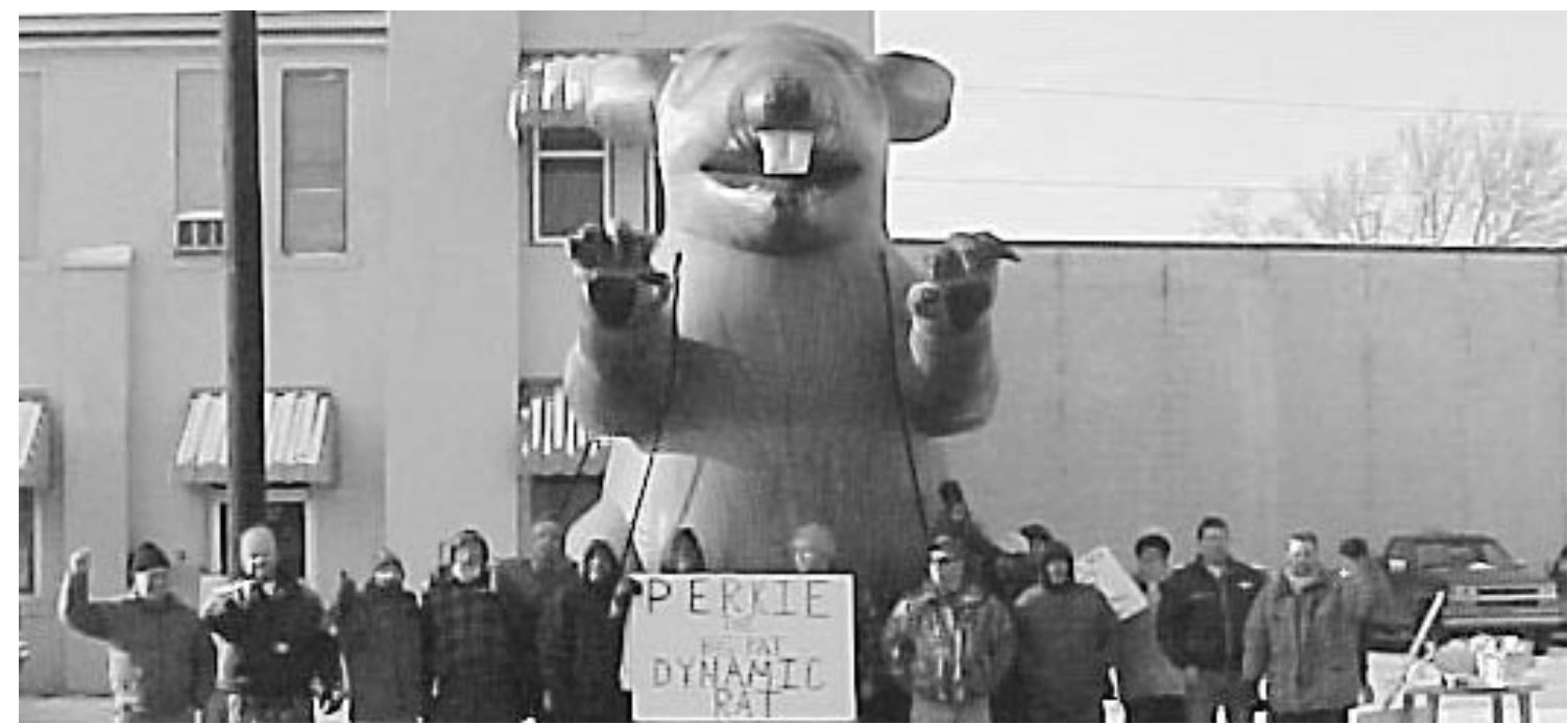
"Perkie the Big Fat Dynamic Rat" lends his support to striking workers.

pital for treatment and released. Brother Ulrey is now proudly back marching on the picket line. Despite the pressure, poor weather and the holiday season the workers have vowed to remain strong until a fair and equitable contract is won!