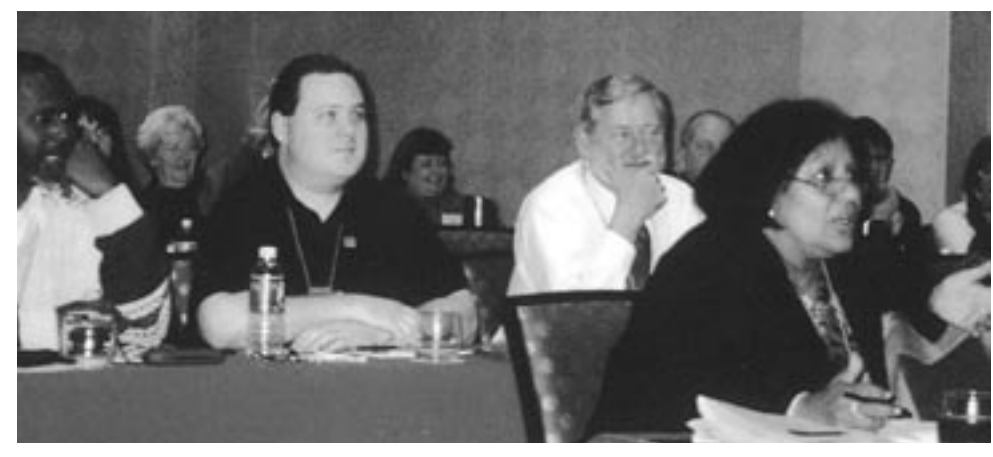
Members participate in the West/Northwest and Northeast Educational Conferences held in Seattle, Washington, October 4-5, 2002 and Providence, Rhode Island on November 23-24.