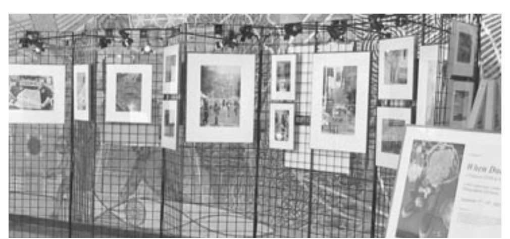
The AFL-CIO's photo exhibit honoring the working heroes of September 11.

of the workers involved in the humanitarian effort were union brothers and sisters. There were pictures of everyday union members work-