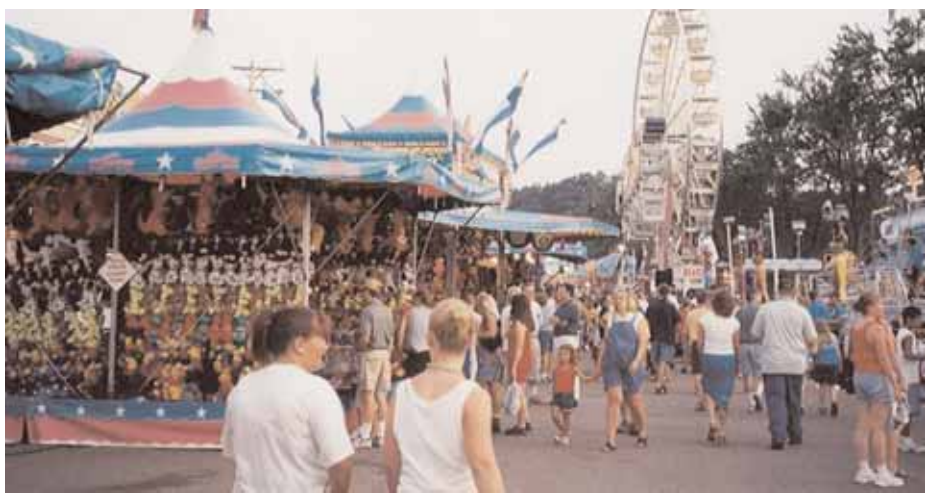
Local 459 members enjoy the Ingham County Union Family Fair Day.

The Fair Day is sponsored by the Greater Lansing Labor Council and other unions. A total of 1,500 entry tickets were sold. A portion of the entrance fees is retained by the Labor Council, who reinvests it in the Fair by sponsoring a petting zoo.