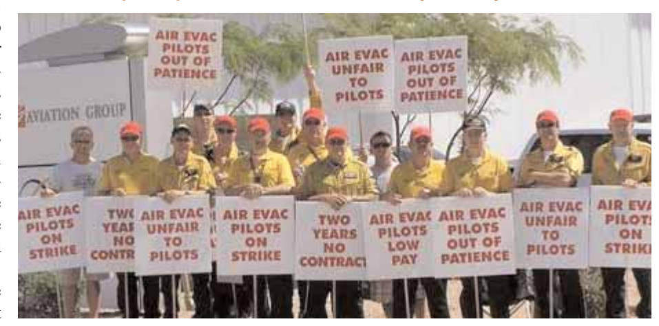
Air Med pilots picket in Phoenix, Arizona. These pilots have been picketing every day in 102 degree heat!