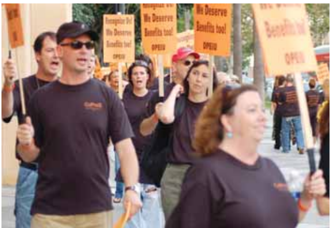
Hollywood production personnel show their support for the OPEIU authorization effort.