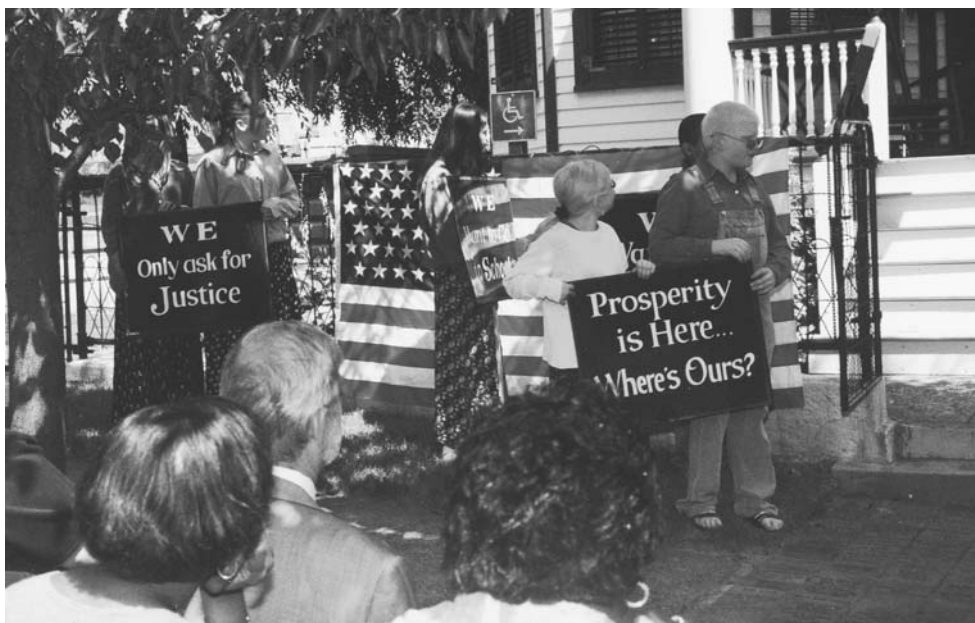
Children participate in the reenactment at the Botto House.