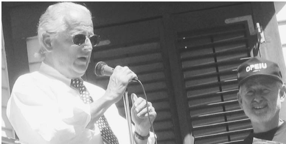
Representative Bill Pascrell (D-NJ) addresses the New Jersey Labor Day parade.