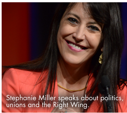
Stephanie Miller speaks about politics, unions and the Right Wing.

President Trumka ended his speech to tremendous applause. “We’ll bring out the best in our country, and in ourselves, to build the future we know we can have. And together, we will win—for our children, for our families, for our future, for our country!” ●