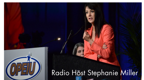
Radio Host Stephanie Miller