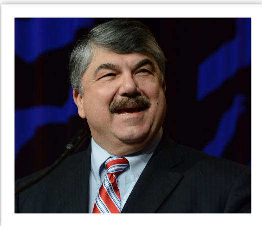
AFL-CIO President Richard Trumka