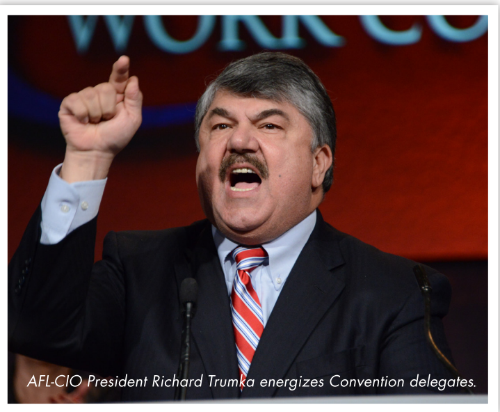
AFL-CIO President Richard Trumka energizes Convention delegates.

On what we, America’s labor workforce should expect, Trumka said, “Here’s what I want you to tell people—expect wins!” Adding, “Expect a day soon—we’ve got to work for it—when America starts creating the good jobs again, and wages and benefits begin to climb...when workers are recognized again for the contributions we make to our society, our economy and our communities.”