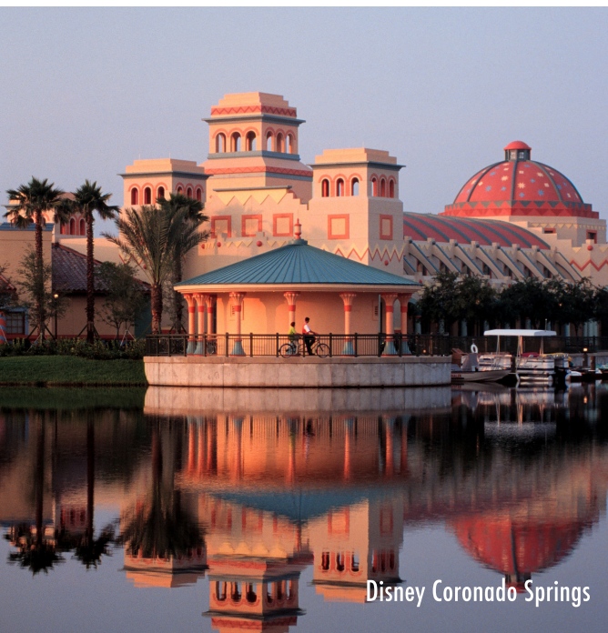
Disney Coronado Springs