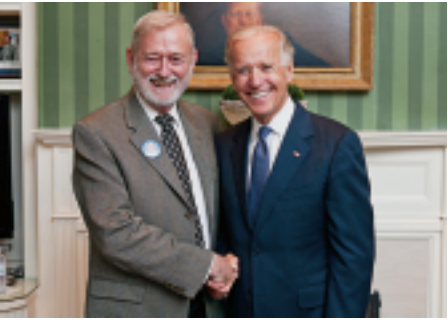
(Used by permission.)

Get involved, be active and make sure that you and the members of your family register to vote as we support "Investing in America: Building an Economy That Lasts!"