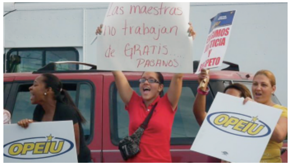
Head Start employees rally for a new contract.

and ensure the terms and conditions of ers to do tasks that were not part of their classification and/or profession. Similarly, we negotiated a discipline process that contains about ten steps that the employer must follow in order to discipline the workers." OPEIU has assigned the new units to Local 4873.